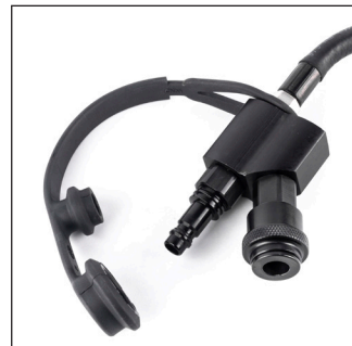
UEBSS (Buddy Breather)