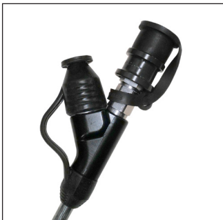
Remote Dual Transfill