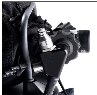
Rapid Intervention Coupling (RIC)