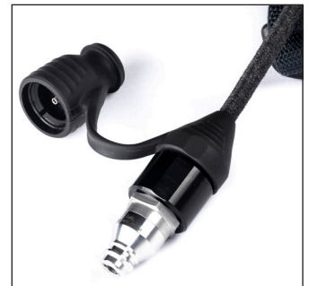
Remote Lightning Fill