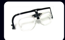
Vision Correction Assembly