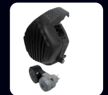
Voice Projection Unit and Microphone Assembly