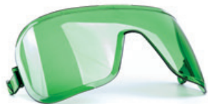
Laser Outsert Assembly