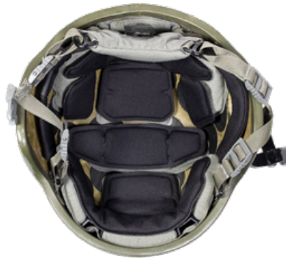
EPIC Air® Liner System