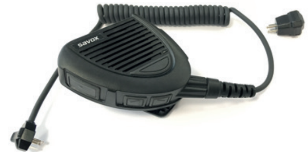
Savox VA-30 Voice Projection Unit with E-Mic