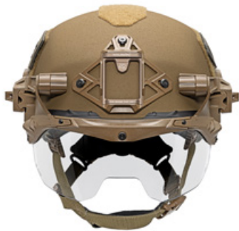
EXFIL® Ballistic Visor