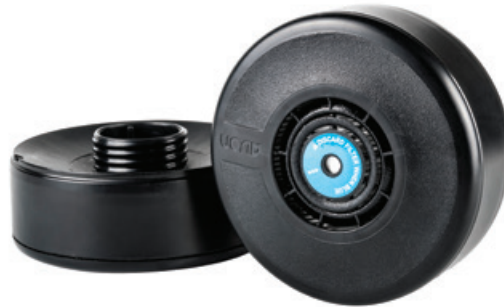
CTCF50 and CTCF50e