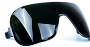
Shade 5 Cutting Outsert Assembly