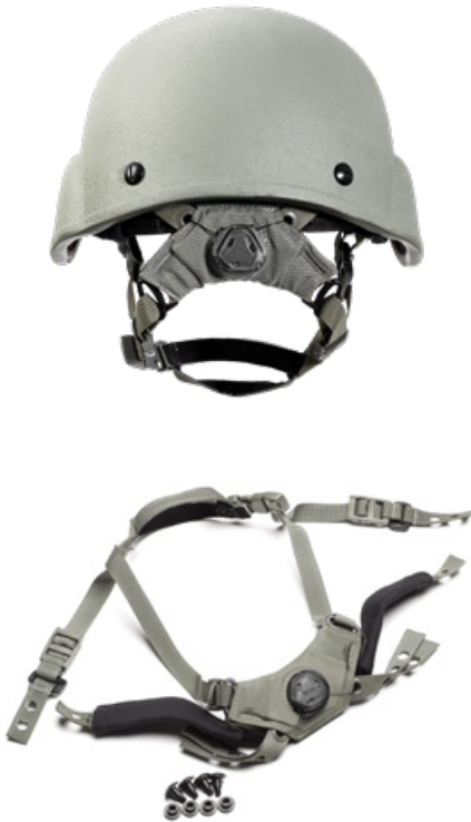
CAM FIT™ Retention System