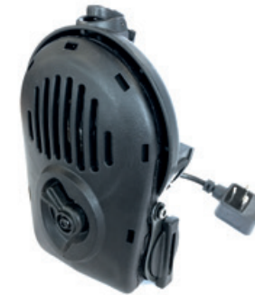
FM53/FM54 Voice Projection Unit with Digital Microphone Assembly