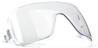
Clear Outsert Assembly