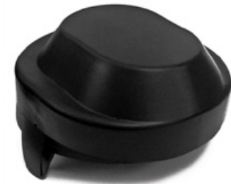
Dust/Decon Filter Covers