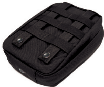
Individual Equipment Carrier