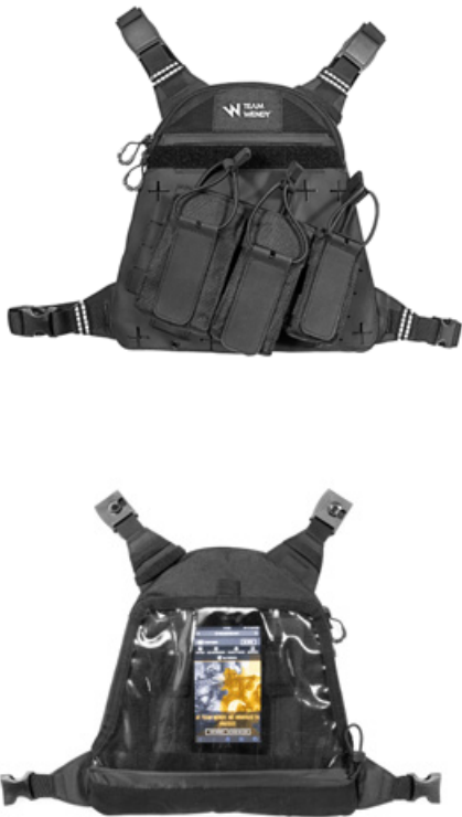
Team Wendy® Radio Rig