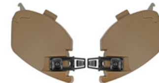
EXFIL® Ballistic Ear Covers