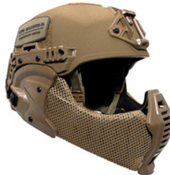
EXFIL® All-Terrain Mandible