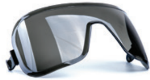
Sunlight Outsert Assembly