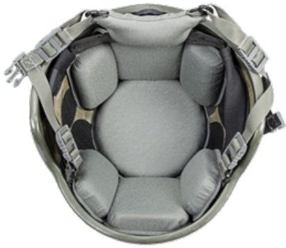
Zorbium® Action Pad (ZAP™) 7-Pad NSN Liner System