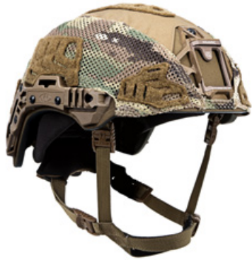
EXFIL® Helmet Covers