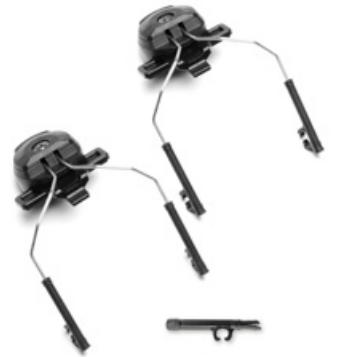
EXFIL® Peltor™ Quick Release Adapters