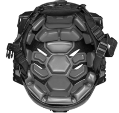
EXFIL® Maritime Liner System