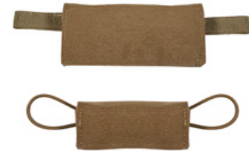
EXFIL® Counterweight Kit