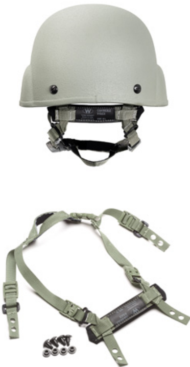
CAM FIT™ H-Back Retention