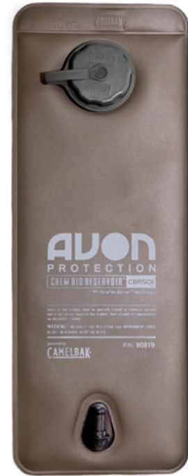
CBR50i 3L Reservoir