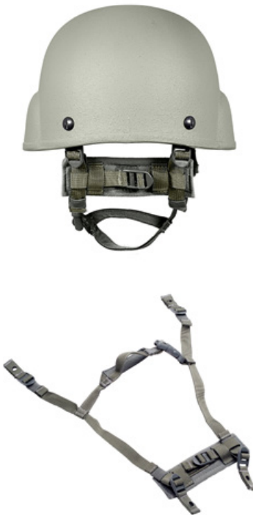
Team Wendy® Standard Chinstrap