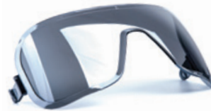
Mirrored Outsert Assembly