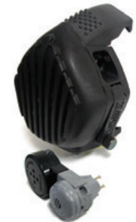
C50/FM50 Voice Projection Unit with Dynamic Mic and Microphone Assembly