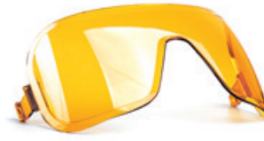
BlueBlocker Outsert Assembly