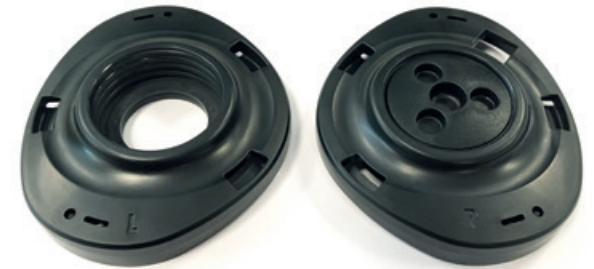
Filter Mount Converters