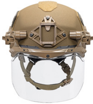
EXFIL® Face Shield