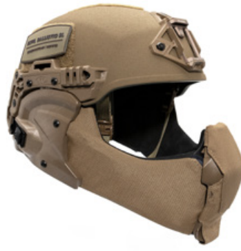
EXFIL® Ballistic Mandible