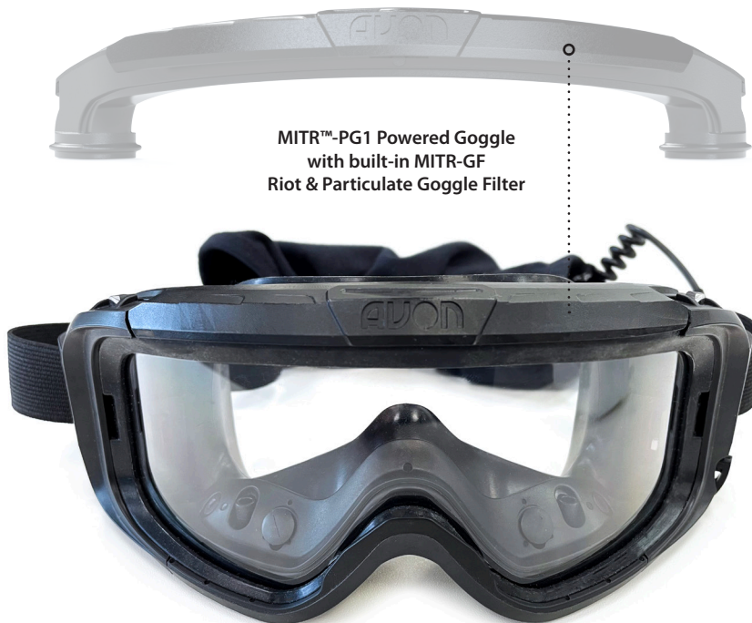
MITR™-PG1 Powered Goggle with built-in MITR-GF Riot & Particulate Goggle Filter

For operators in the field, the MITR-PG1 offers more than just protection. It's built for comfort, compatibility, and endurance. Whether deployed in riot control, counterterrorism, breaching operations, or special forces missions, the goggle's lightweight, fog-resistant, tactical-black design provides clear vision and operational readiness in the most demanding conditions.