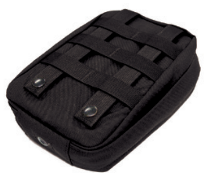
Individual Equipment Carrier