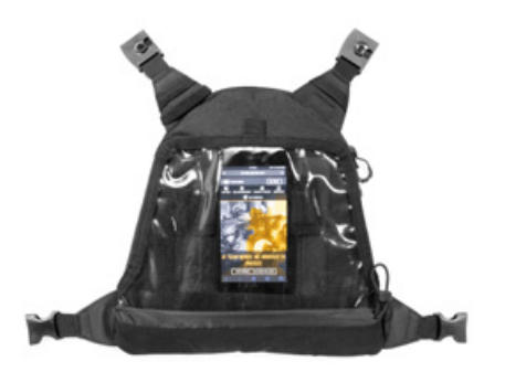
Team Wendy® Radio Rig