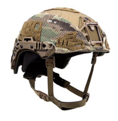
EXFIL® Helmet Covers