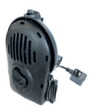
FM53/FM54 Voice Projection Unit with Digital Microphone Assembly