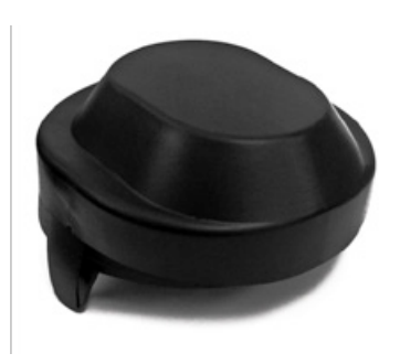
Dust/Decon Filter Covers