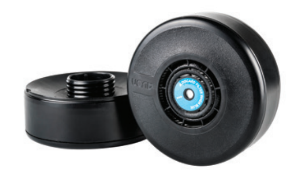
CTCF50 and CTCF50e