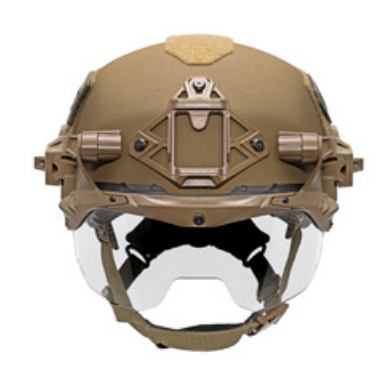
EXFIL® Ballistic Visor