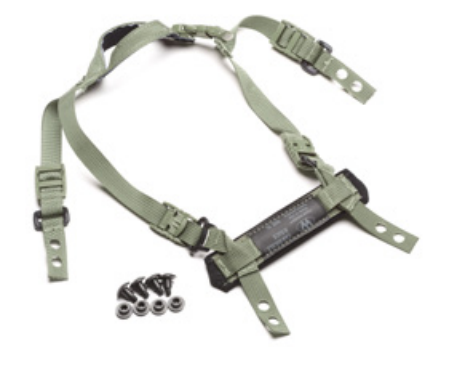
CAM FIT™ H-Back Retention