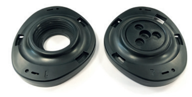
Filter Mount Converters