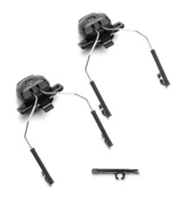
EXFIL® Peltor™ Quick Release Adapters