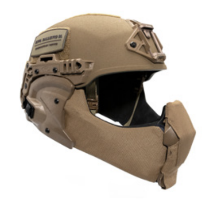
EXFIL® Ballistic Mandible