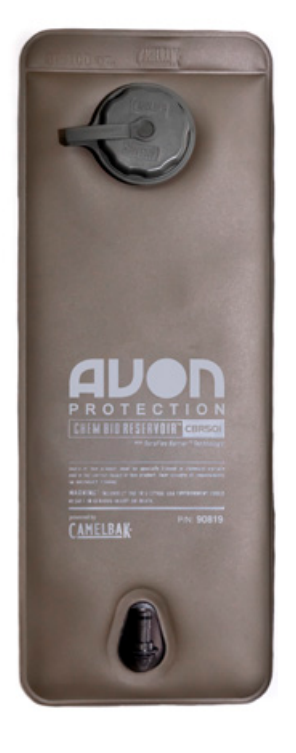
CBR50i 3L Reservoir