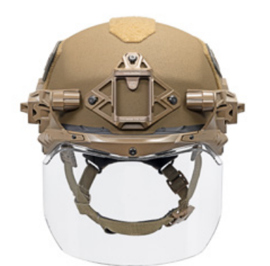
EXFIL® Face Shield