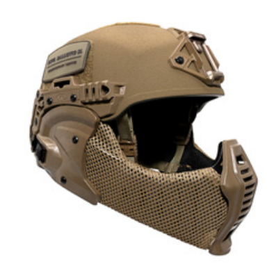
EXFIL® All-Terrain Mandible